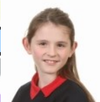
Year 5 Fern